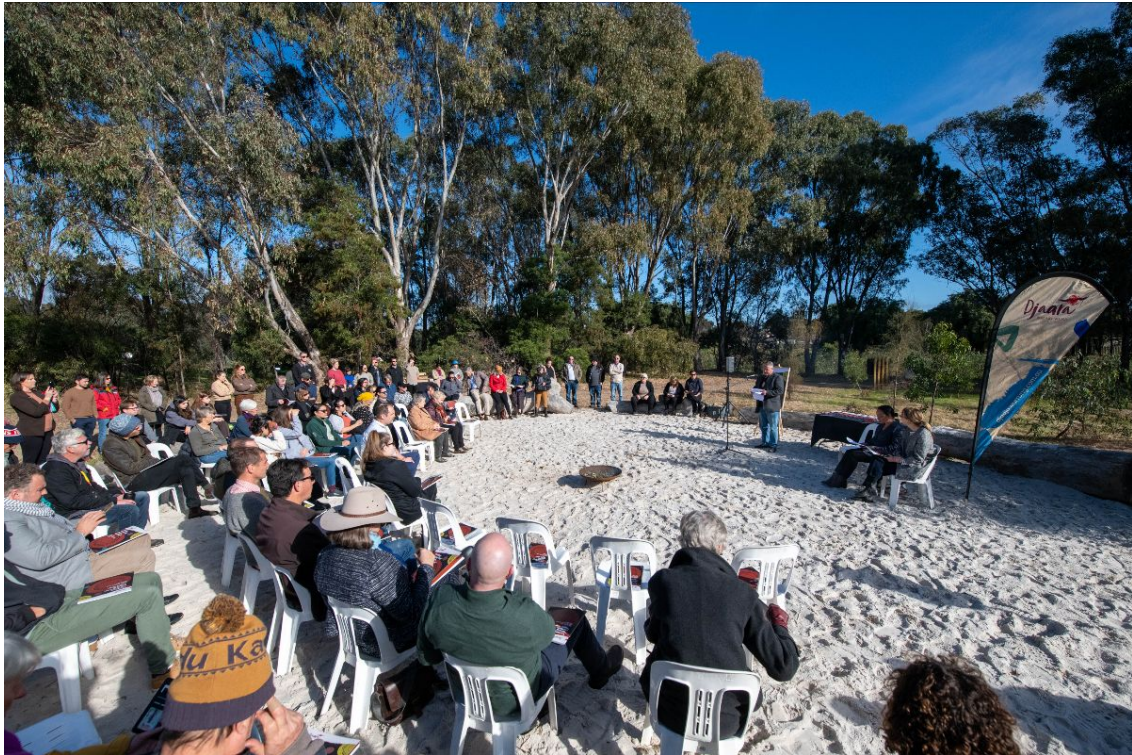
People came from far and wide for the launch of the Dja Dja Wurrung Climate Strategy.

Focus areas and actions in the Strategy highlight DJAARA's leading role in cultural landscape management, restoring cultural fire to country, water and forest management and the renewable energy transition.