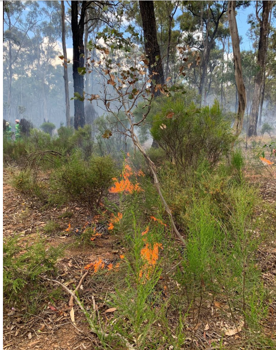
Whipstick-Brights Rd burn, Greater Bendigo National Park. Cultural burn training, December 2022.

We have recently welcomed a new forestry and fire crew at DJANDAK. The focus now is ensuring we can lead delivery of all scheduled burns safely and effectively.